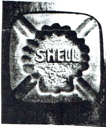
2 1/4" x 2 1/4"